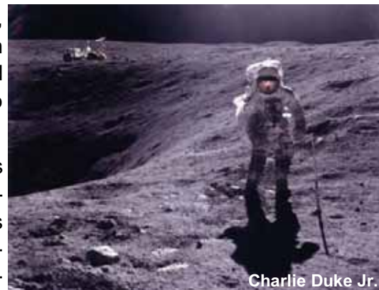
Charlie Duke Jr.

Duke has logged 4,147 hours of flying time which includes 3,632 hours in a jet aircraft. Duke is most famous for his participation in Apollo 16 as lunar module along with John W. Young as space commander and Thomas K. Mattingly II as command module pilot. Apollo 16 was the first scientific expedition to inspect, survey and sample materials and surface features in the Descartes region of the lunar highlands. Apollo 16 achievements include: largest payload placed in lunar orbit (79,109 pounds); first cosmic ray detector deployed on lunar surface; first lunar observatory with the far ultraviolet camera; and longest inflight EVA from a command module during trans-earth coast (1 hour and 13 minutes). Duke logged 265 hours and 51 minutes in space, which includes 21 hours and 28 minutes in extra-vehicular activities.